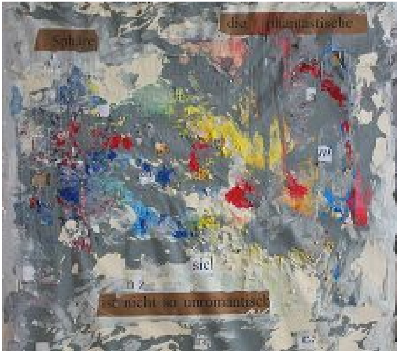
Peter Tepe: ...die phantastische Sphäre ist nicht so unromantisch [...The Fantastic Sphere is not that Unromantic] (2014).