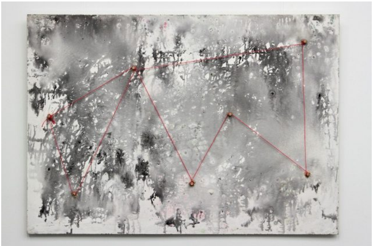
Peter Tepe: Der Wolkenvermesser war da [The Cloud Surveyor was Here] (2015).

By contrast, studies of individual artists published in w/k differ from previous ventures in that from the outset they are guided by the aim to compare and differentiate the individually explored constellations of science and art: this too is innovative.