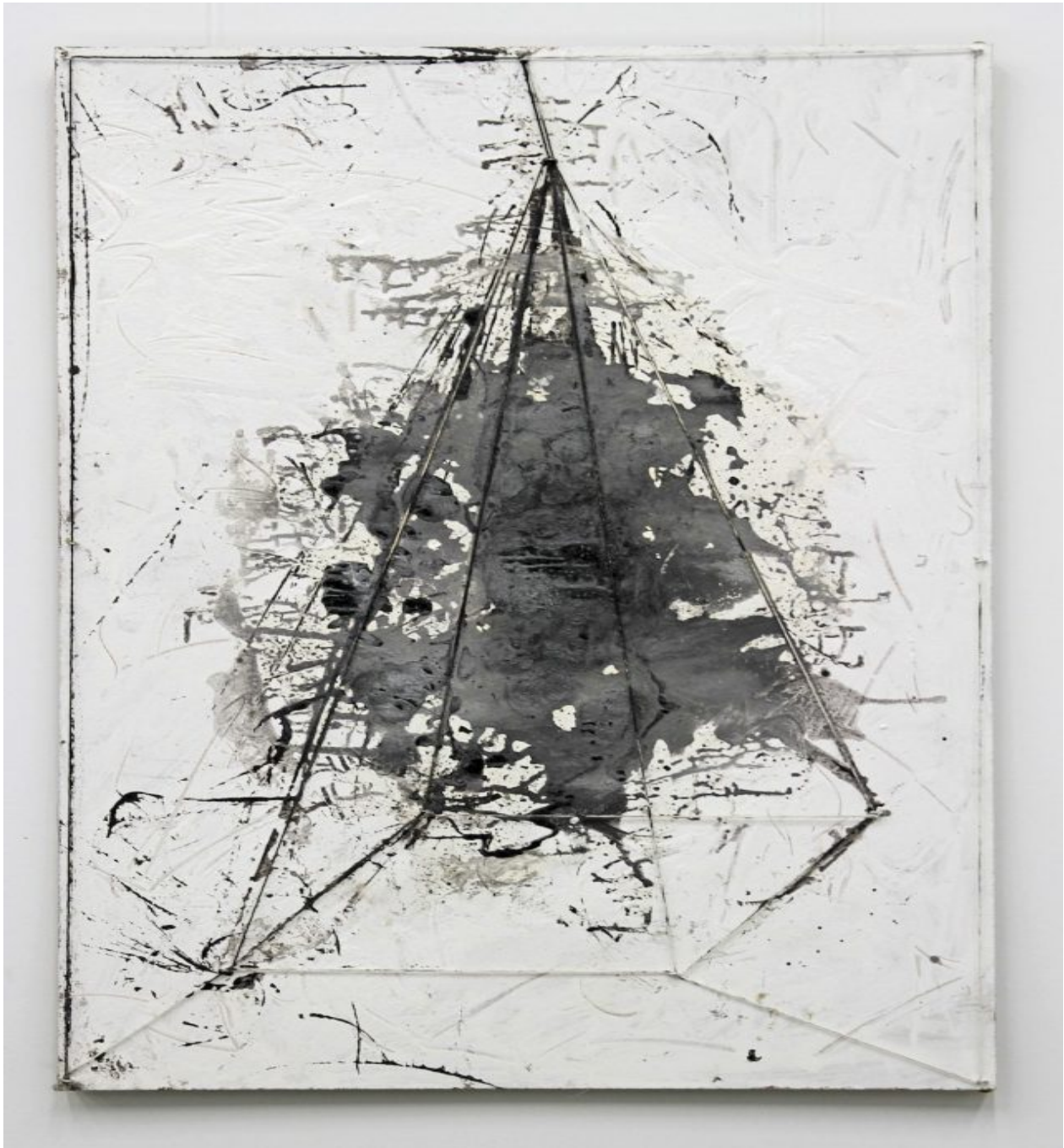
Peter Tepe: Bedrohte Pyramide [Endangered Pyramid] (2016).